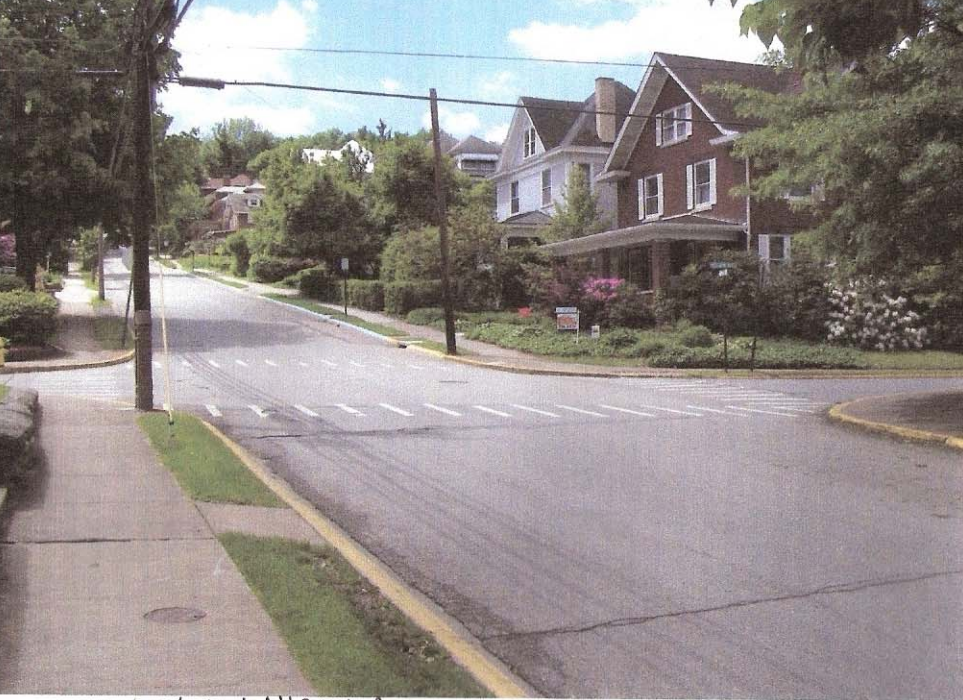
Grand St & Wilson Ave.