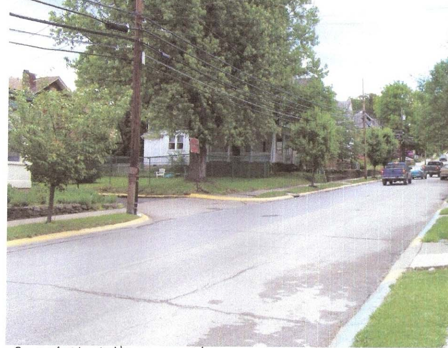
Grand St. & Hagans St.